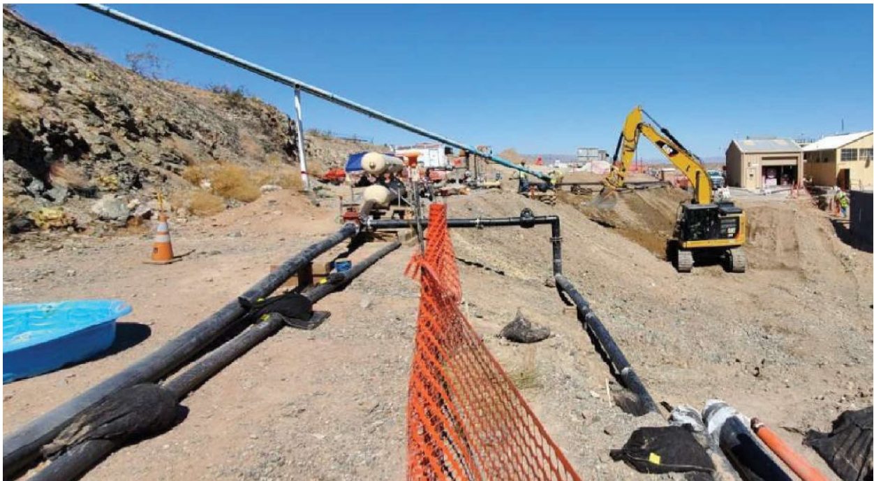
Photo showing excavation south of the Remedy-produced Water Tank Pad inside TCS.