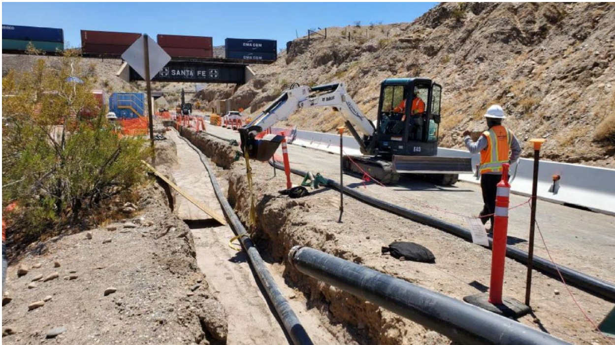
Photo showing pipe installation in Pipeline C Segment C13.