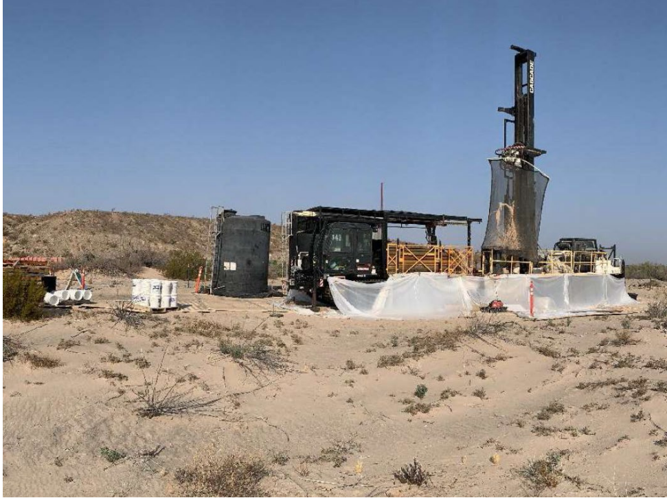
Photo showing installation of MW-96 with a rotosonic rig.