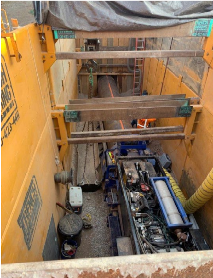
Photo showing Cal Boring auger operation.