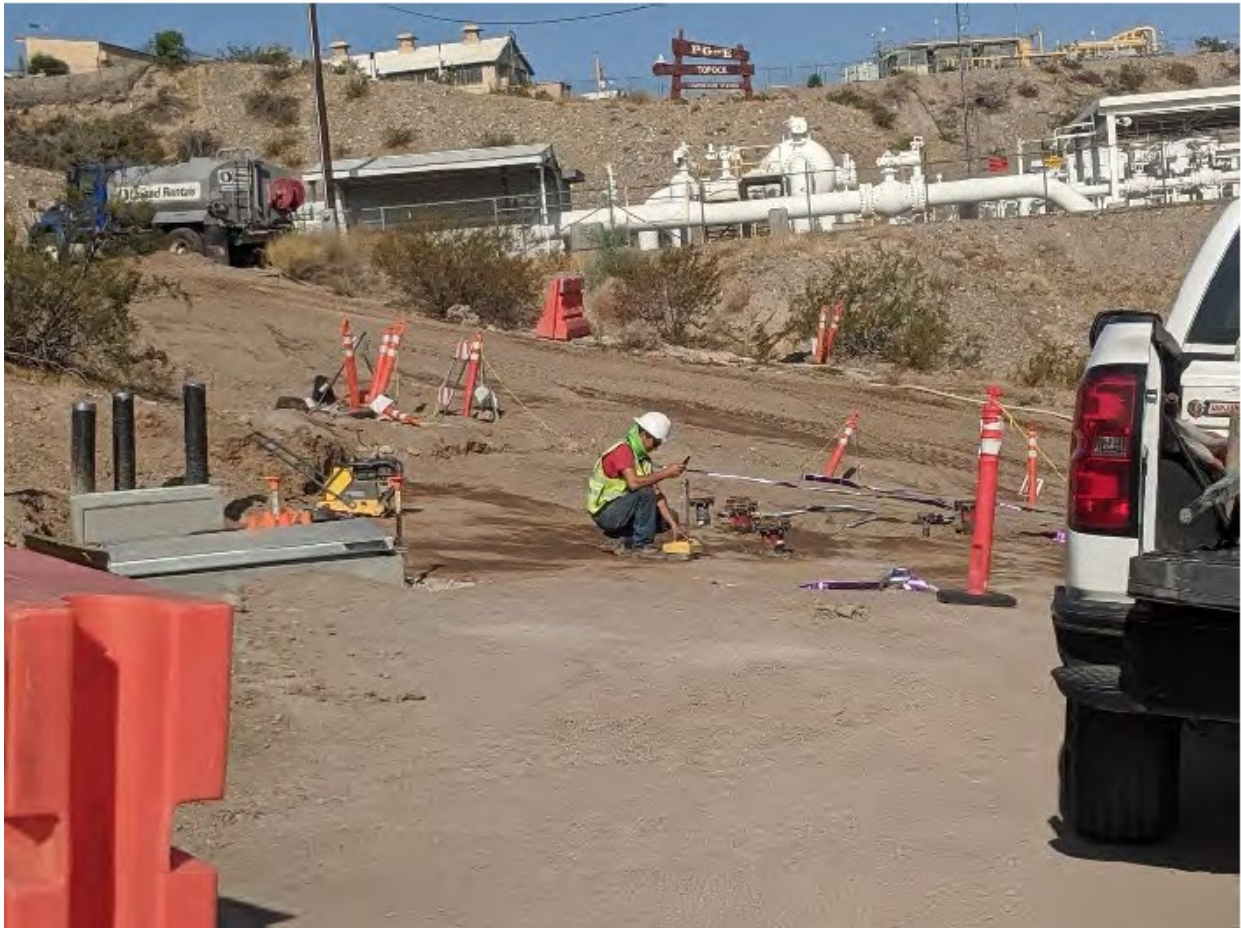
Photo showing compaction at Pipeline F.