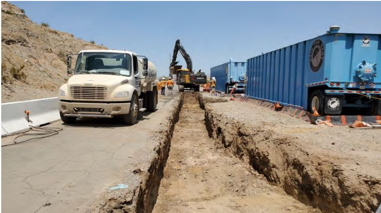
Photo showing excavation of Pipeline C Segment C13.