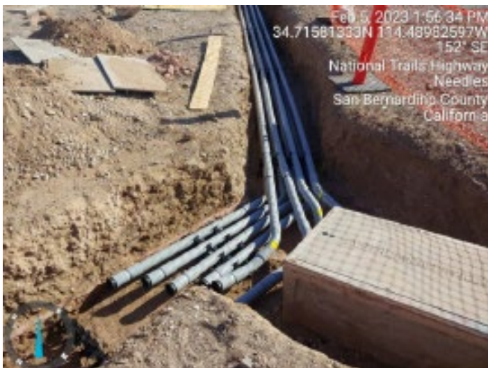
Photos showing installation of pipes and conduits at C11 on east side of National Trails Highway