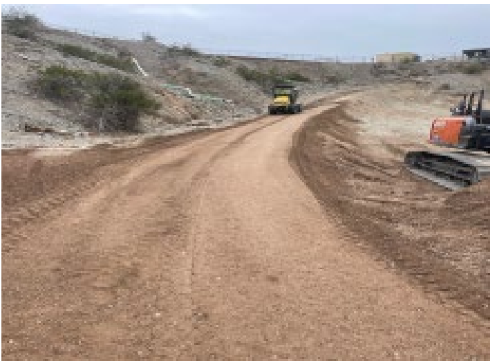
Photos showing the rebuild of the access road on top of Pipeline I2 from TCS to Bat Cave Wash