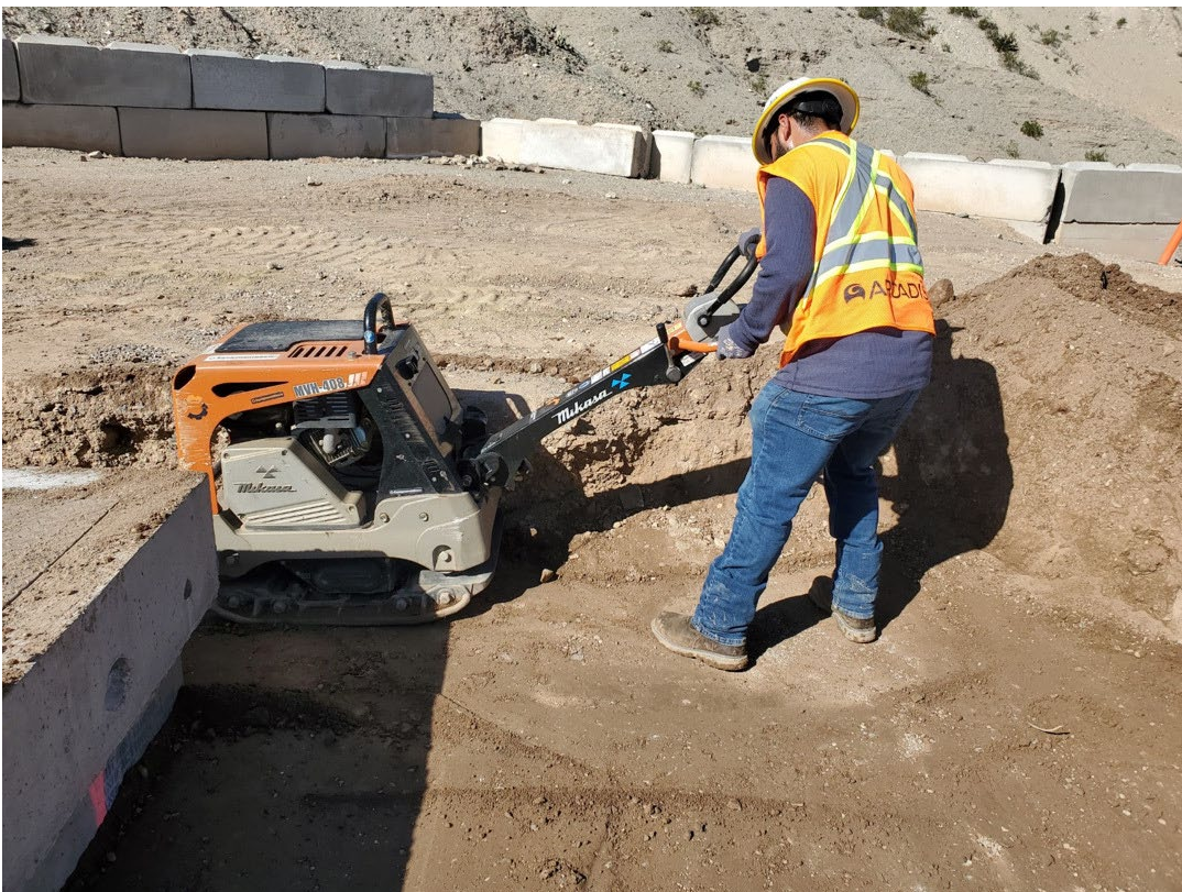
Photos showing backfill and compaction around TWB- 1 well vault