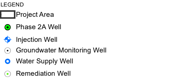
Figure 2-2 Well Locations Groundwater Remedy Construction PG&E Topock Compressor Station Needles, California