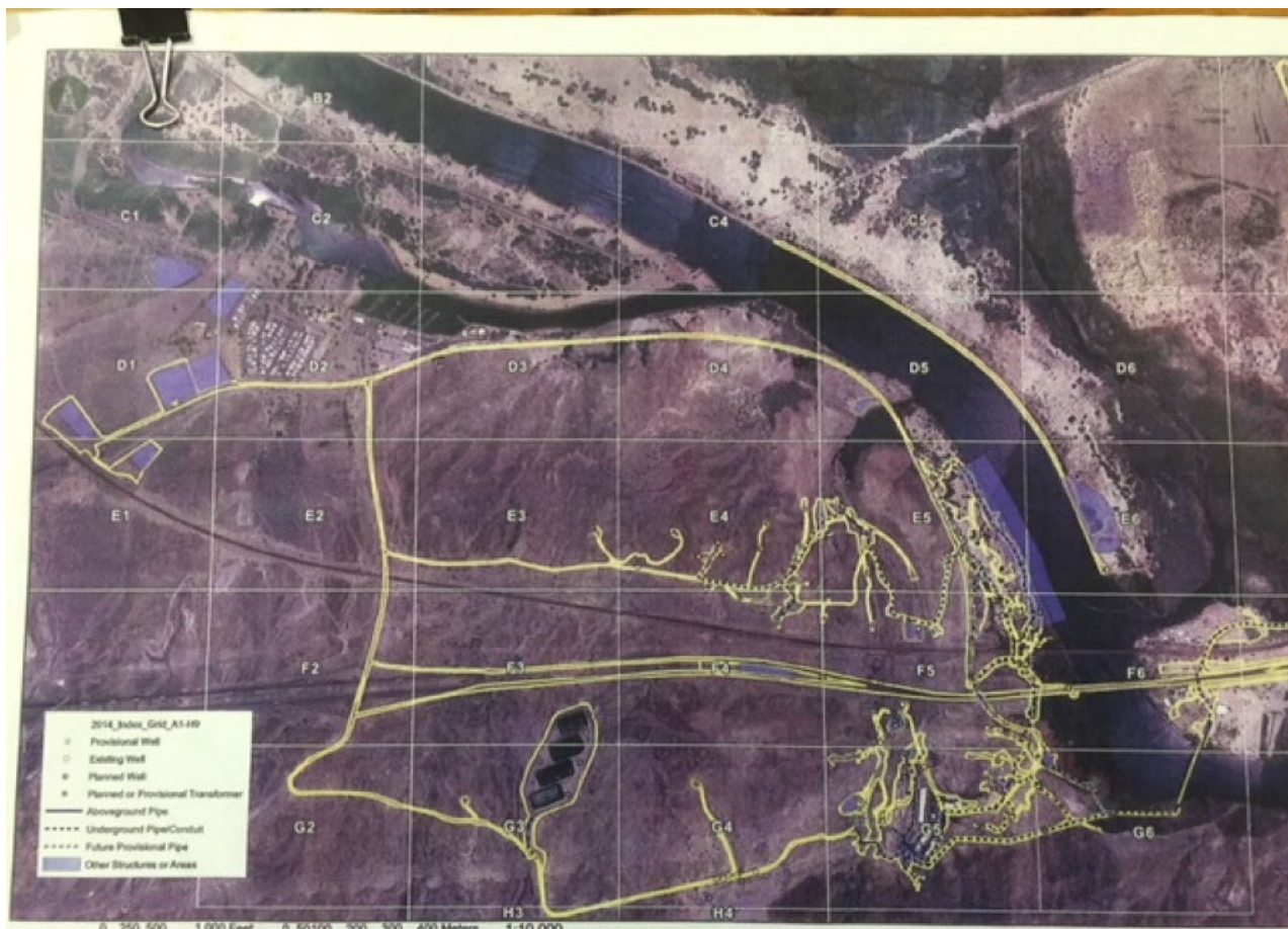
Figure showing a grid superimposed on the Topock site map. Each grid position is denoted by an letter followed by a number.