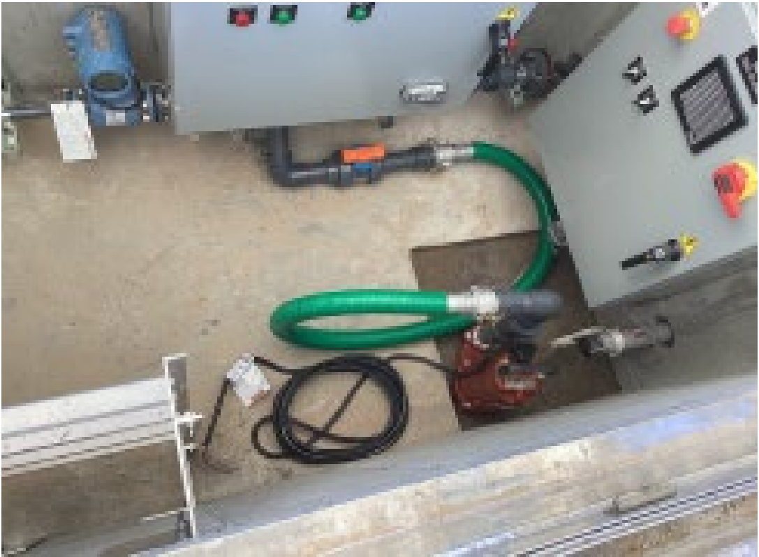
Photo showing sump pump installation in vault RB-5.