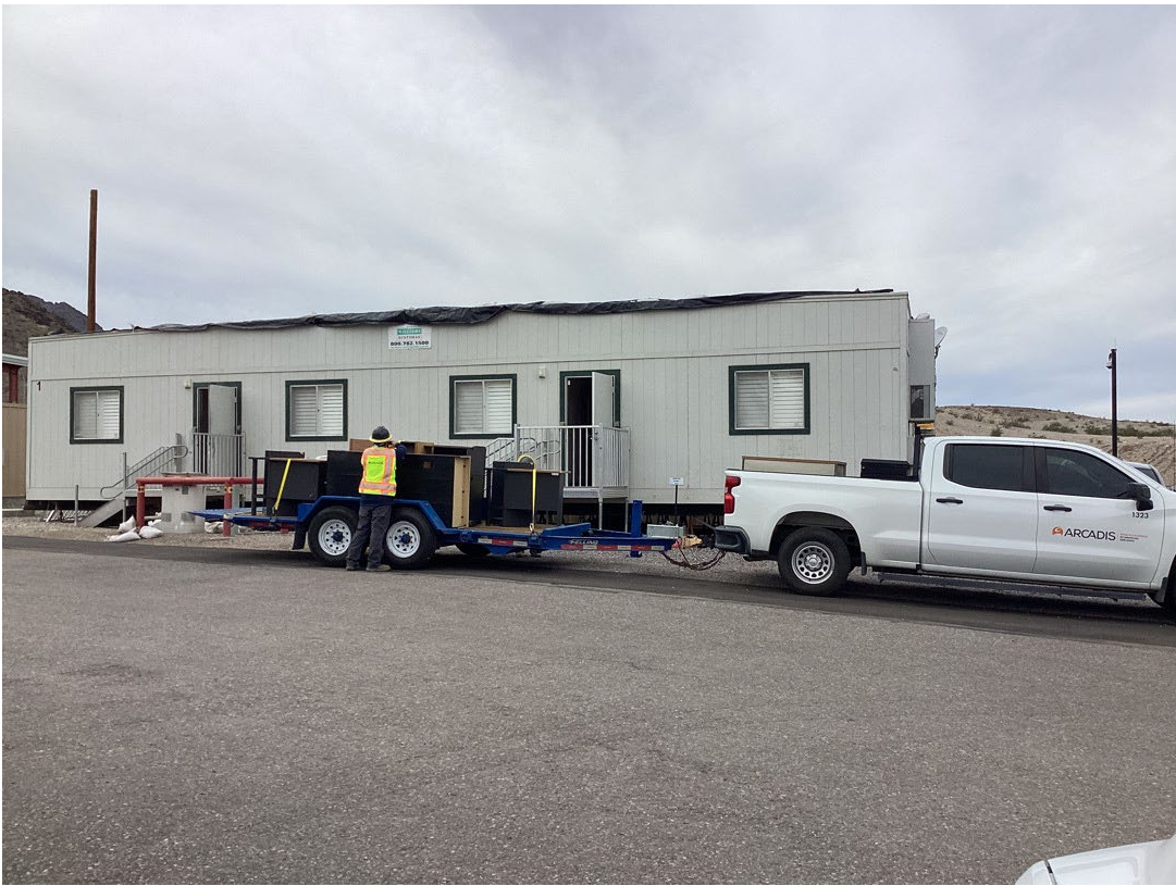
Photo showing loaded trailer ready to transport to Transwestern Bench.