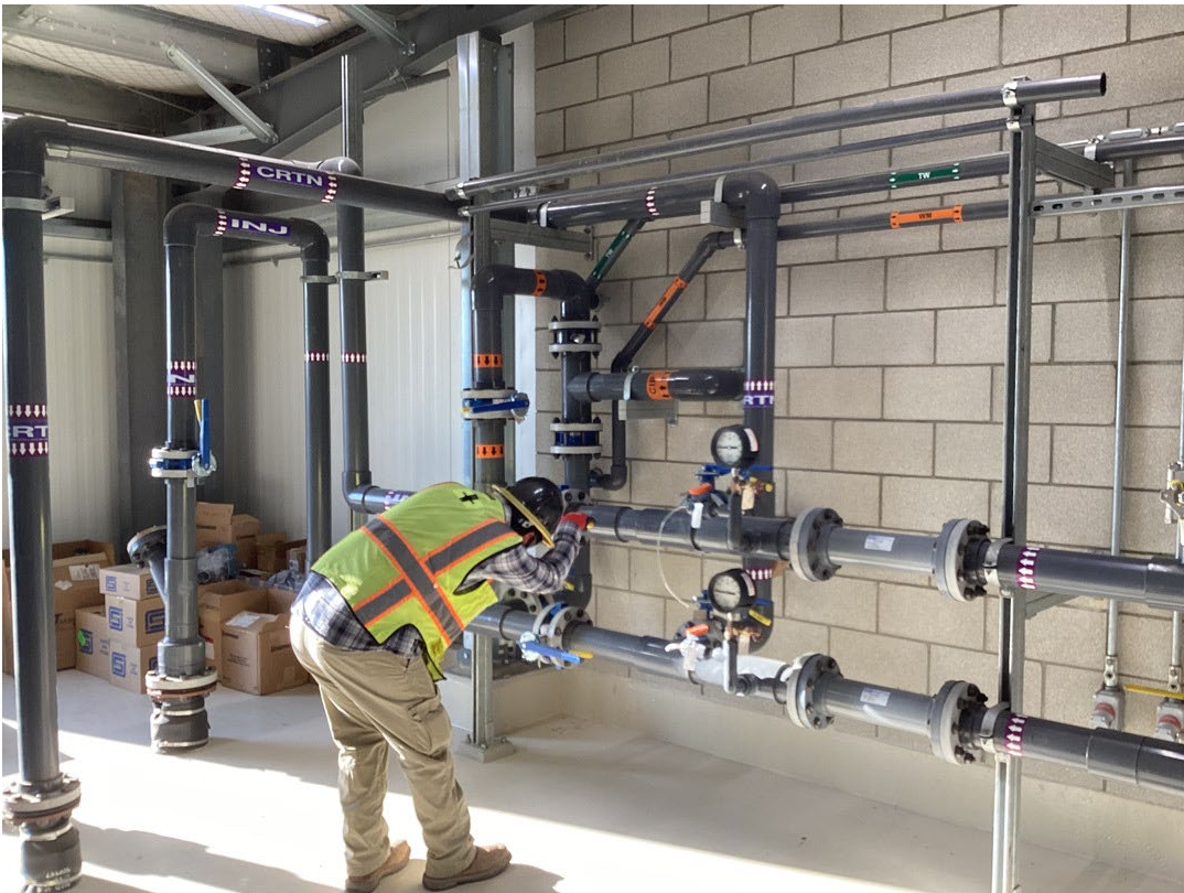
Photos showing mechanical work inside the Carbon Amendment Building.