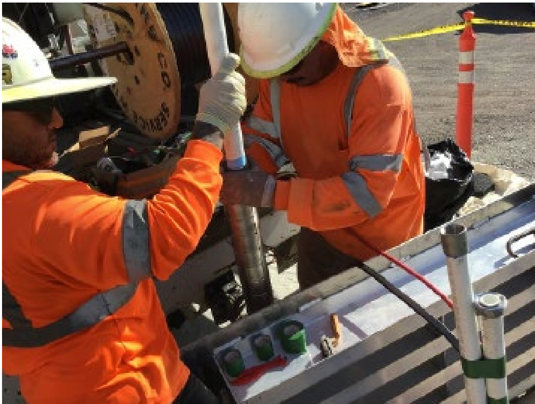
Photo showing Cascade installing shallow pump at IRZ-25.