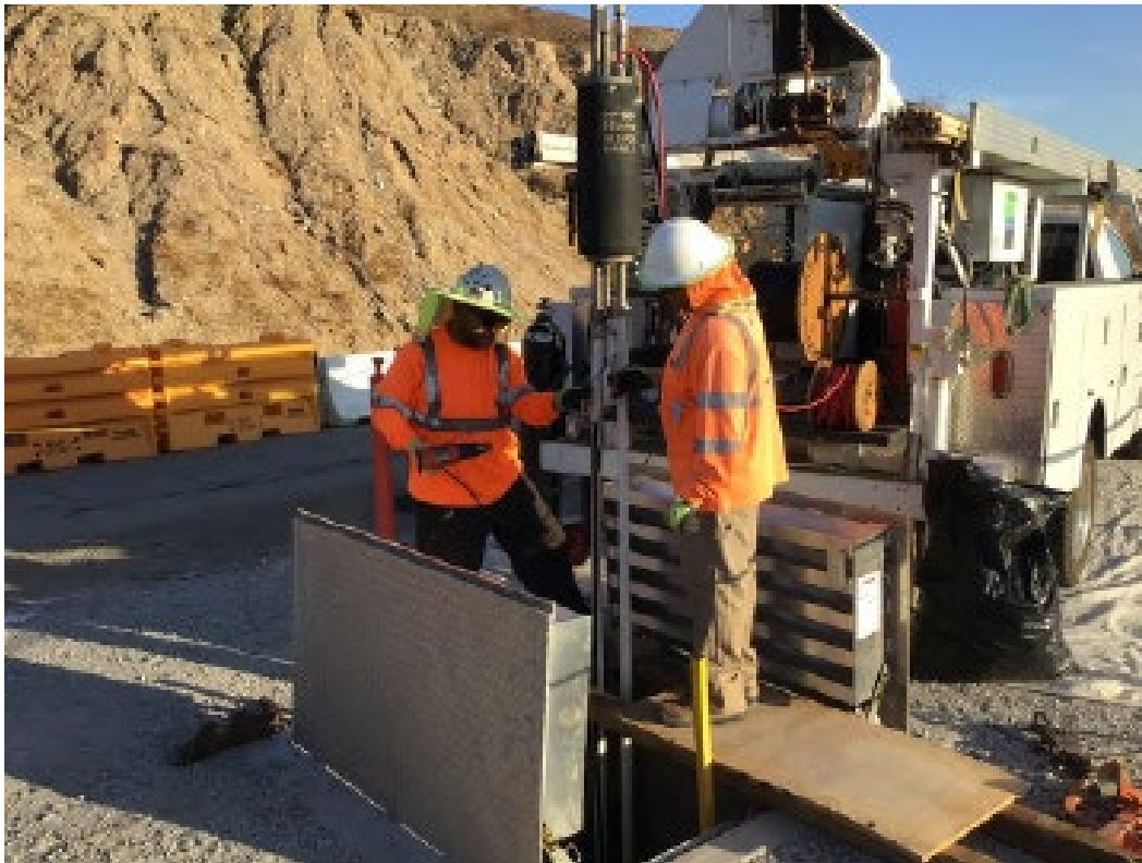
Photo showing Cascade installing deep portion of downhole equipment at IRZ-25.