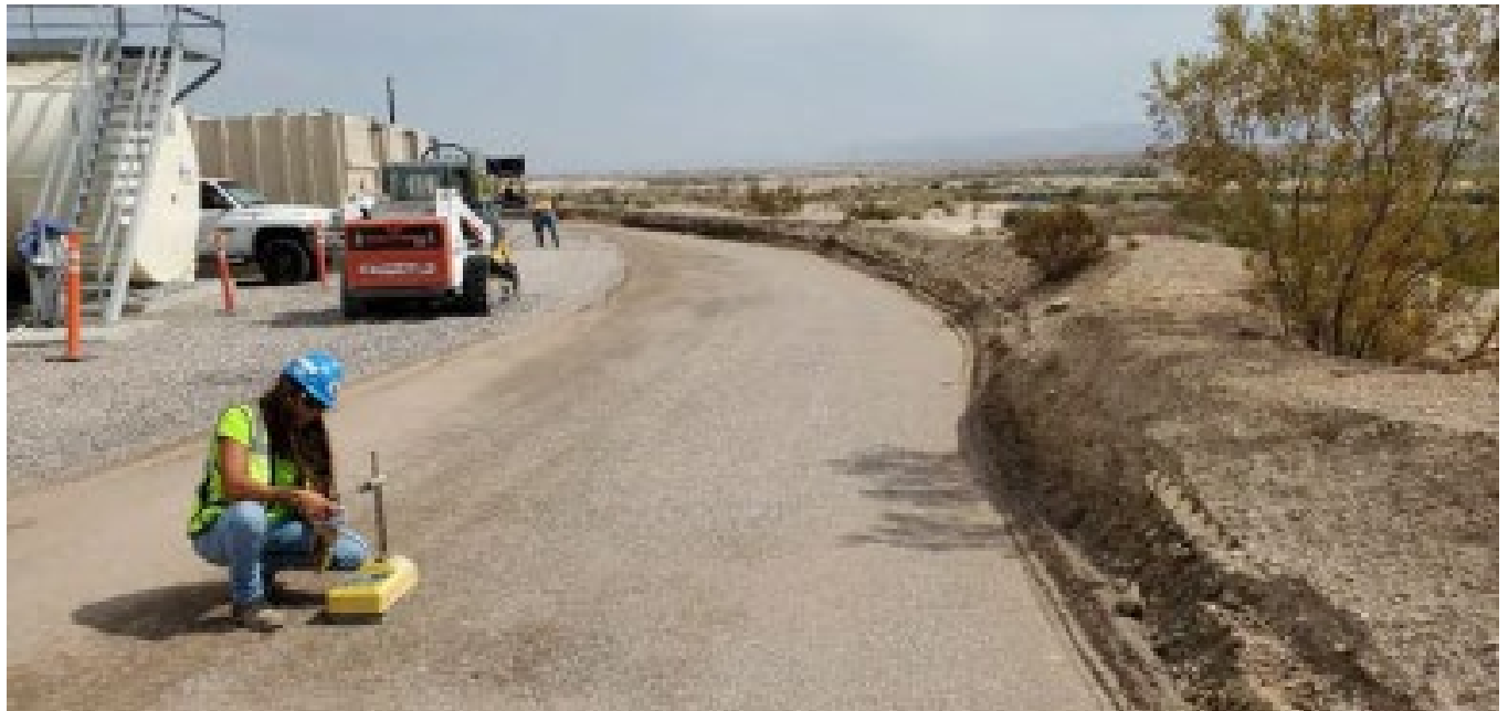
Photo showing Western Tech performing compaction test on MW-20 Bench final grade.