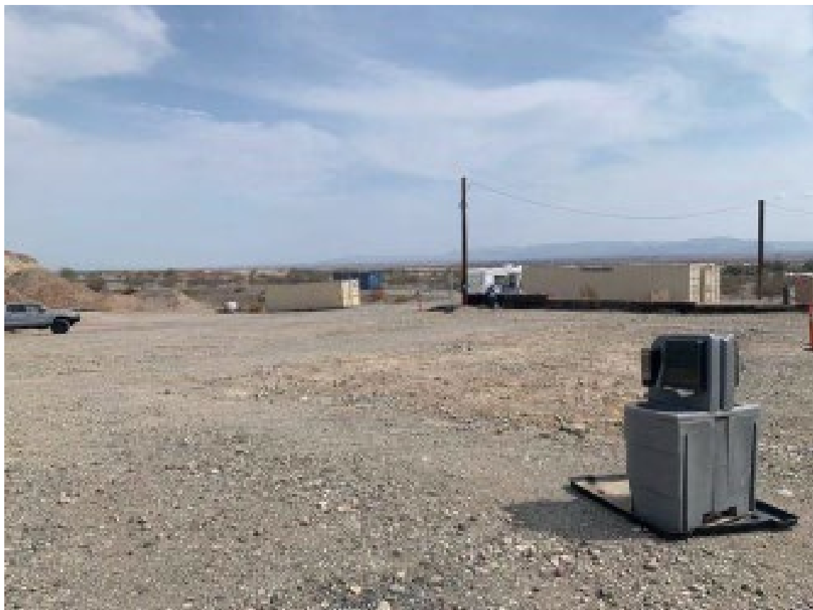
Photo showing the remaining connex boxes and AE's trailer at the Soil Processing Yard.