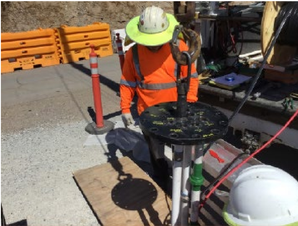
Photos showing Cascade attaching downhole equipment to well flange at IRZ-25.