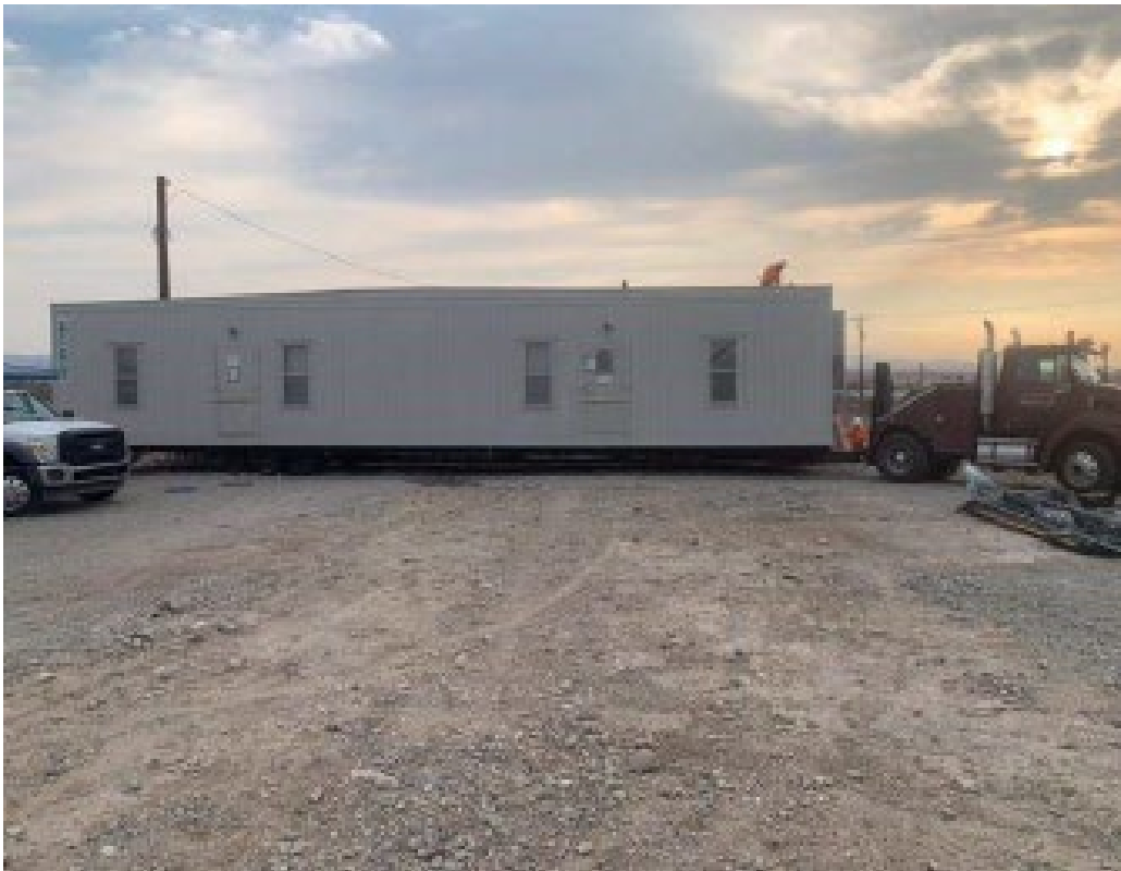
Photo showing demobilization of trailer at the Soil Processing Yard.