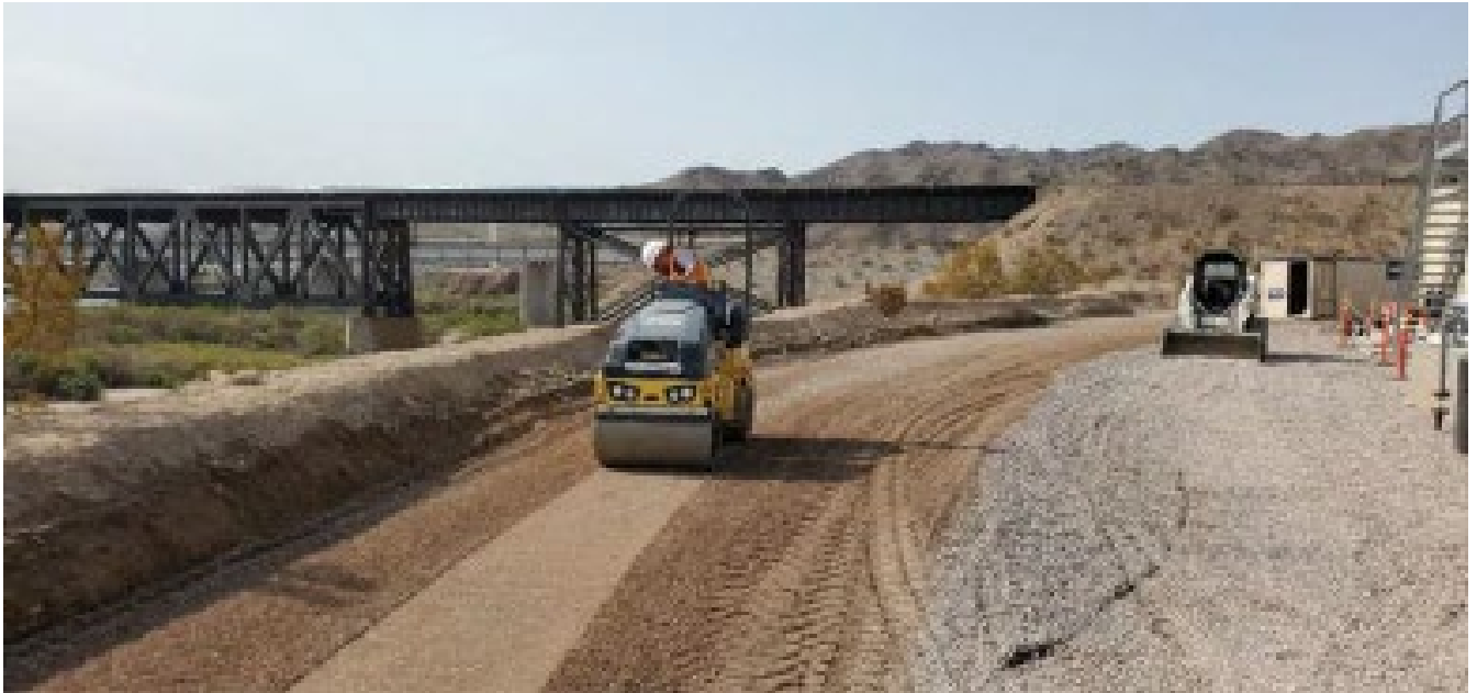
Photo showing compacting on the river side of MW-20 Bench.