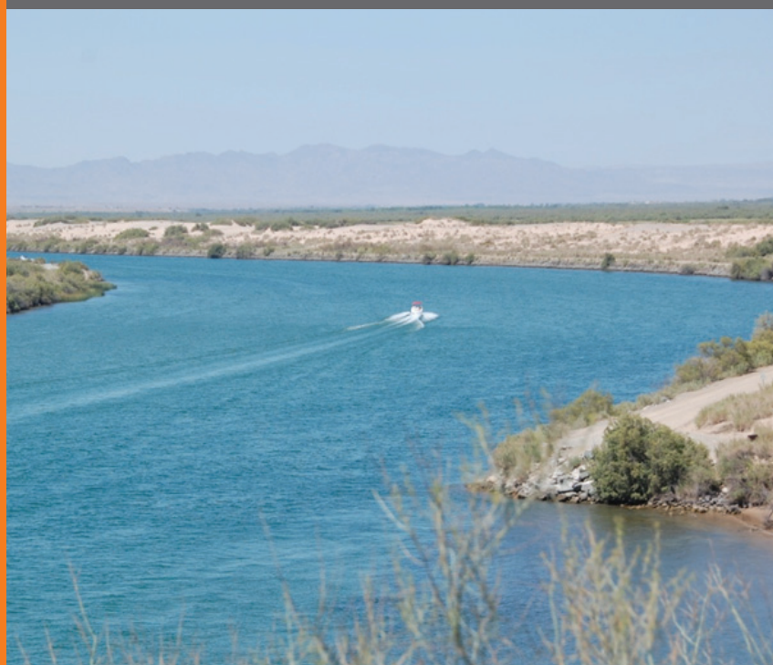
A view from the Colorado River, looking north