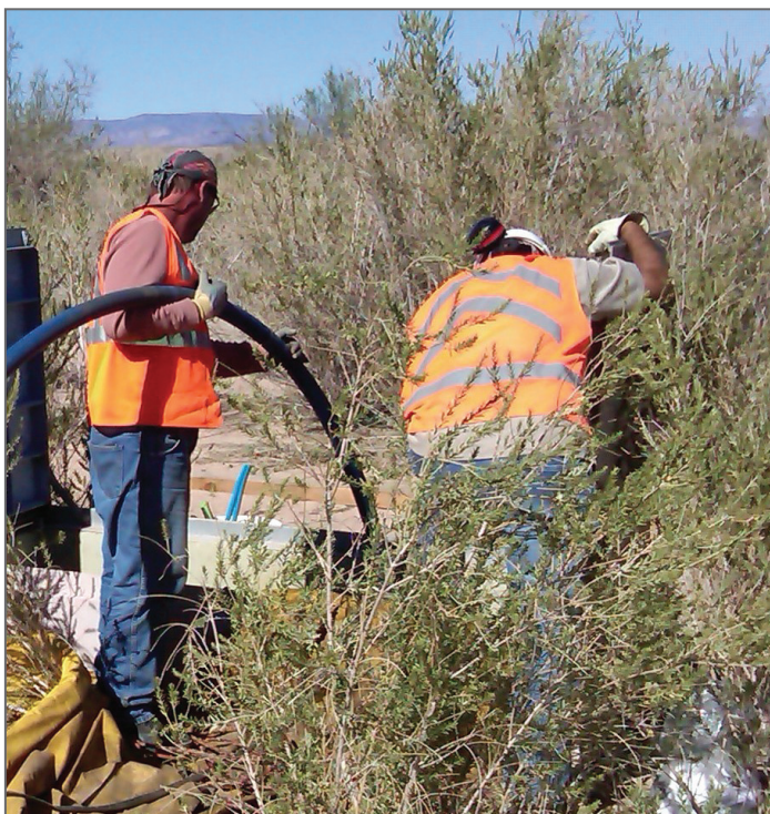
PG&E crews install a pump near the Topock Compressor Station

PG&E is currently in the process of drafting a Response to Comments that will describe how this feedback will be considered and incorporated into the Intermediate (60%) Design. The Response to Comments document is expected to be completed in April 2012 and will be discussed during a Technical Work Group (TWG) meeting with agencies, tribes and stakeholders, scheduled for April 19, 2012.